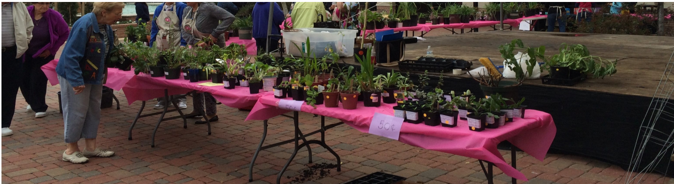
NCGC Plant Sale 2014-Villagio Katy,TX